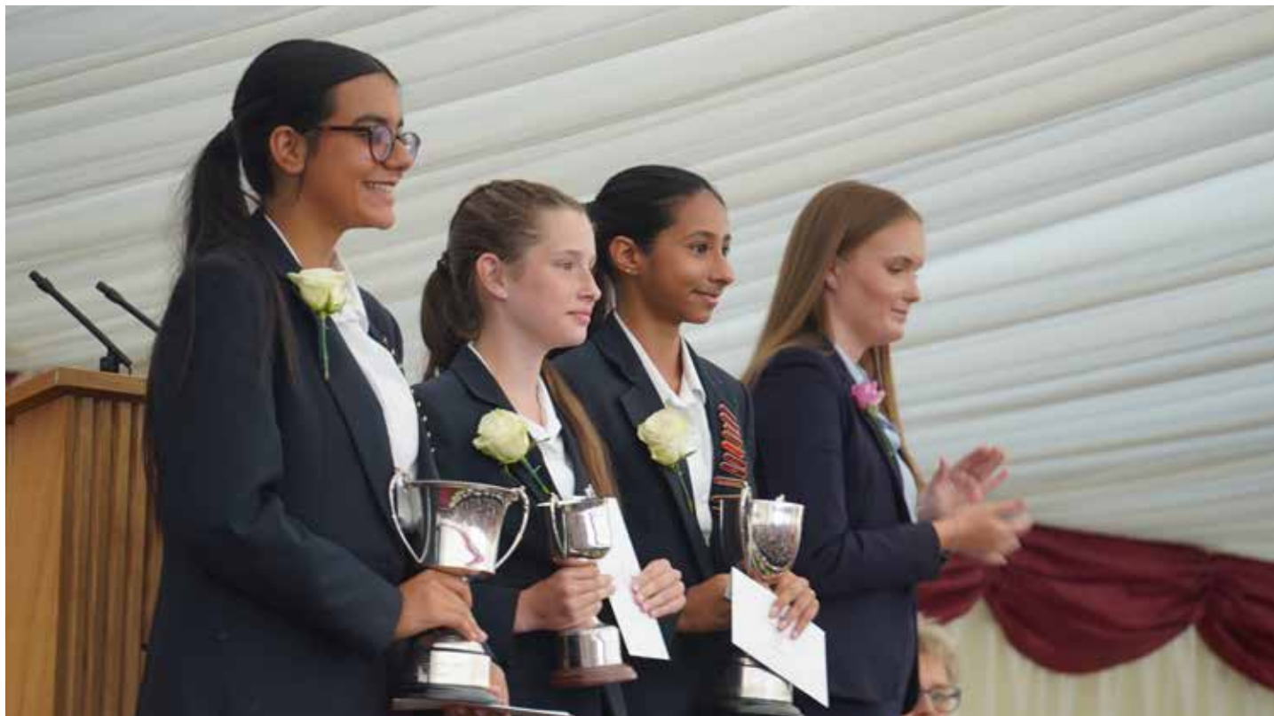
Year 8 enjoyed celebrating the end of their time at Prep School with their teachers and families. After a Chapel Service, prizes were awarded before everyone enjoyed a relaxed lunch.