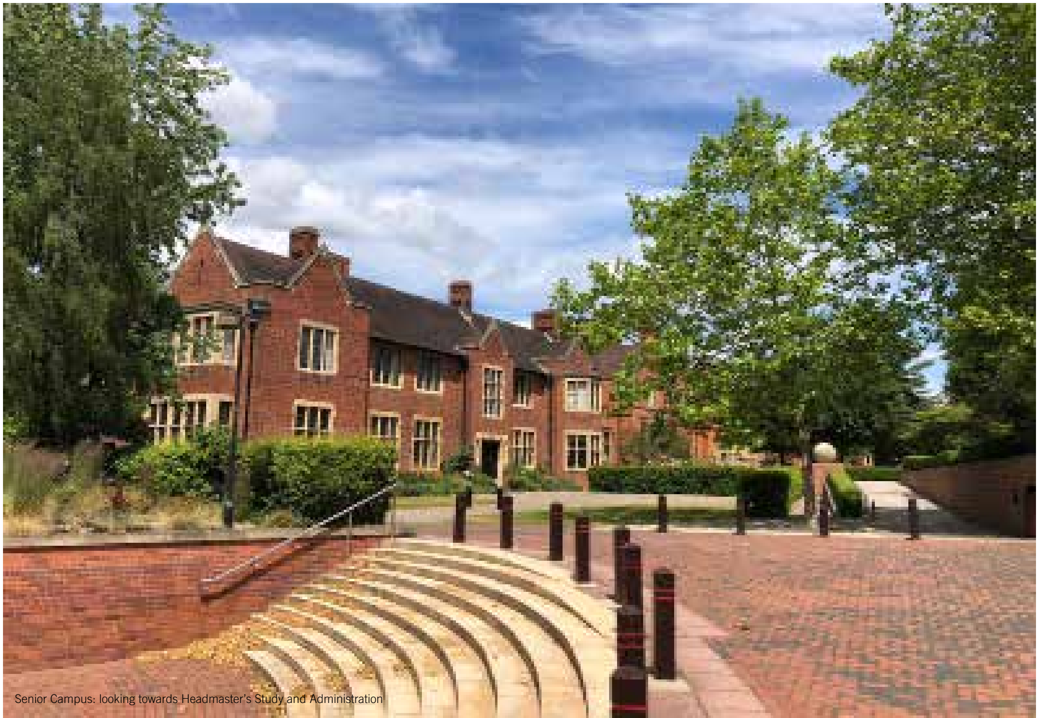
Senior Campus: looking towards Headmaster's Study and Administration